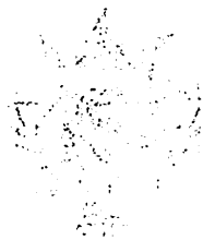
TABELA DE ENCARGOS ANEXO I da Lei Municipal nº 250/2008